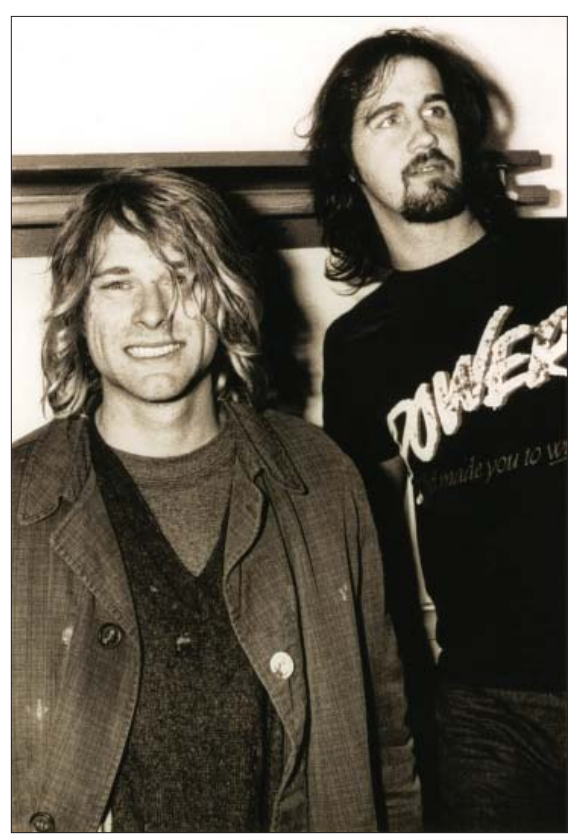
Kurt Cobain and Krist Novoselic pose in their dressing room backstage at the Paramount Theatre in Seattle after Nirvana's performance on October 25, 1991. Their landmark album "Nevermind" made its debut that week.

local Seattle media news, we made number one record. It was a lot of fun. Again things were just happening so fast so it was just part of the whirlwind.