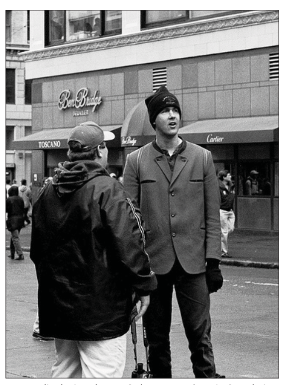
Novoselic during the WTO demonstrations in Seattle in 1999. He was outraged by the vandalism he observed.

Novoselic: Absolutely. And again it just has to do with your personal safety. I went to Croatia in 1993 and I saw the bomb-craters and the misery, the fear, the anger. And that happened when the rule of law collapsed. Then there was a vacuum, and people took the matters into their own hands. It's a downward spiral. It just gets really ugly. We can't say that it can't happen here, because it could happen anywhere.