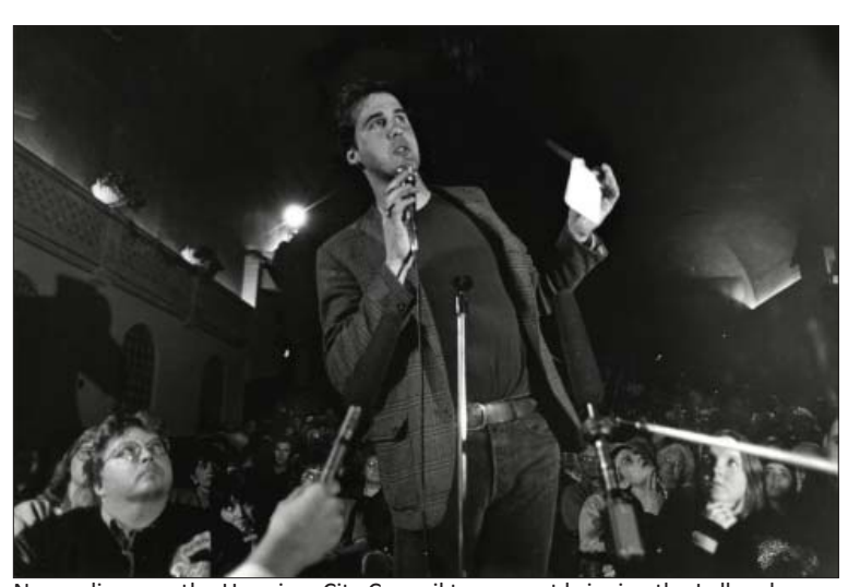
Novoselic urges the Hoquiam City Council to support bringing the Lollapalooza music festival to town in 1994.

Hughes: So, when's this first stirring when you're thinking seriously about politics? Did this happen during Nirvana?